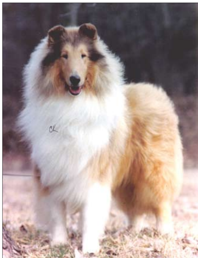
Ch. Afterhours Firestorm