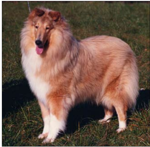
Ch. Wickmere Noblesse Oblige

I have times when I think it would be great to have it written in our standard so there is never another argument about the sable merle as a color, or that a judge can read it without question that it's acceptable. But... then I think about the addition of a class just for them. My concern is... Would it encourage some select few to breed just for the color? That is not what we should be doing. I would be worried it MAY get some people flirting more with DD and I do NOT approve of that at all. When you get health problems because of the color (or lack of pigmentation).. then it's NOT good for our breed and we are not doing anything to protect our breed. QUALITY is how each individual interprets it. One person will think that a