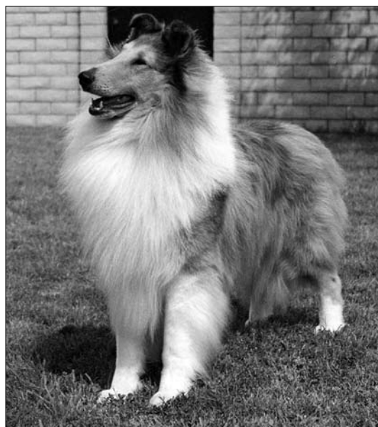
Ch. Gambit's Trick of Light, ROM