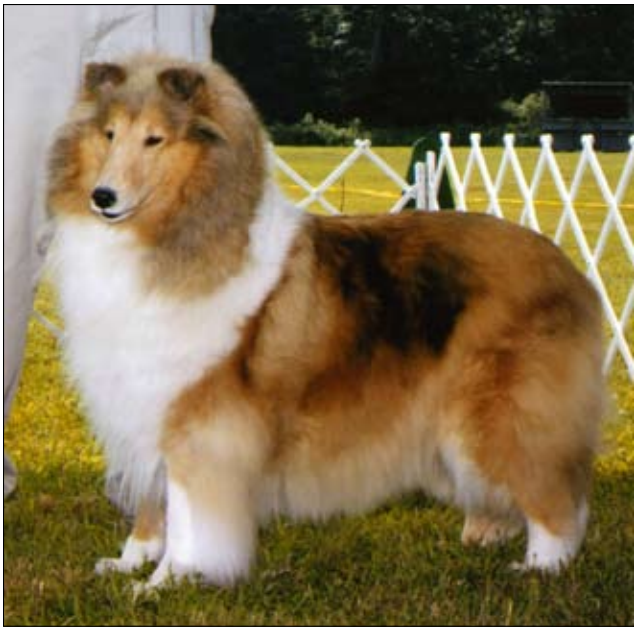
Ch. Hi-Crest Blame It On Rio

I have thought about it for a long time too and as you know, I have had a sable merle or two. I do think that there are enough classes for them to be shown in puppy, bred by and Am bred. Yes, Open too if they don't carry the merleing too heavily but that's up to the exhibitors discretion and they can't complain if they put one in the open class that sticks out like a sore thumb. A quality animal should be judged on virtues against our standard. Eye color seems to be one of the hurdles when it comes to sable merles. My personal feelings are the same as they are in blue merles. A bright blue eye or a glass eye is awful no matter if it's blue or sable merle.