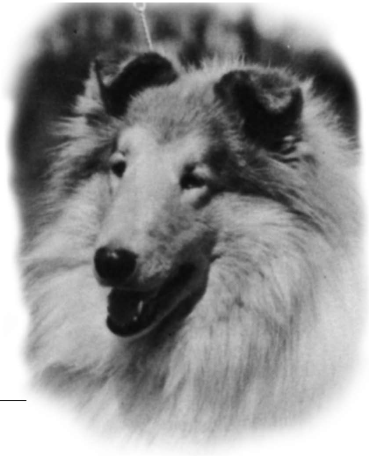
Ch. Wayside After The Gold Rush