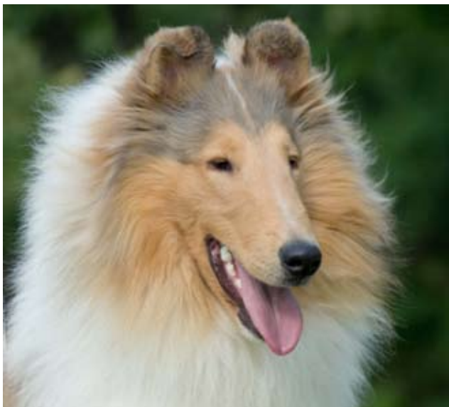
Ch. Sassy's Smokin' Dragon