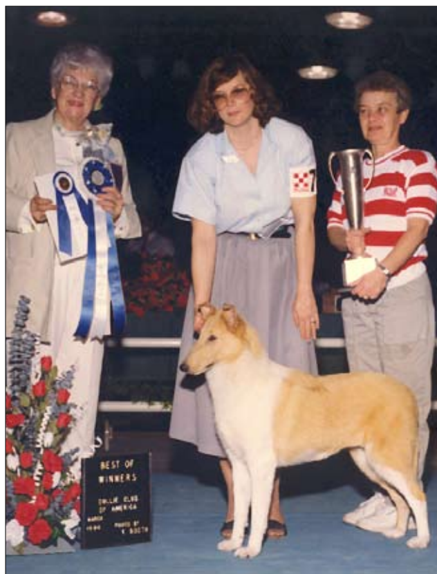
Ch. Capella's Masquerade