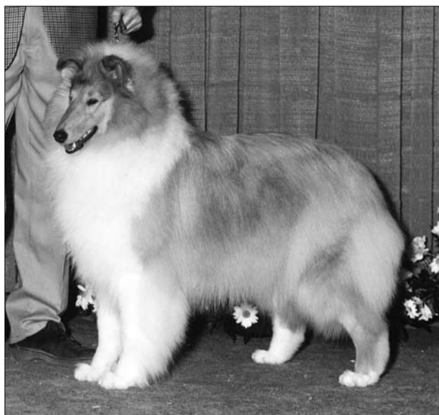
Ch. Overland Endless Summer, ROM