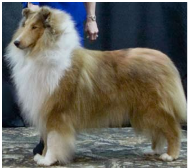
Ch. Southland's Beyond The Glory