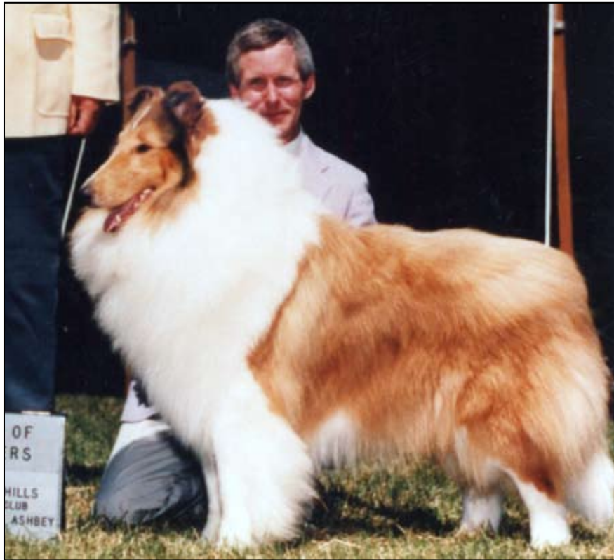
Ch. Perry's Sundather Tradition, ROM

Respondents who have judged the national specialty are indicated by asterisk.