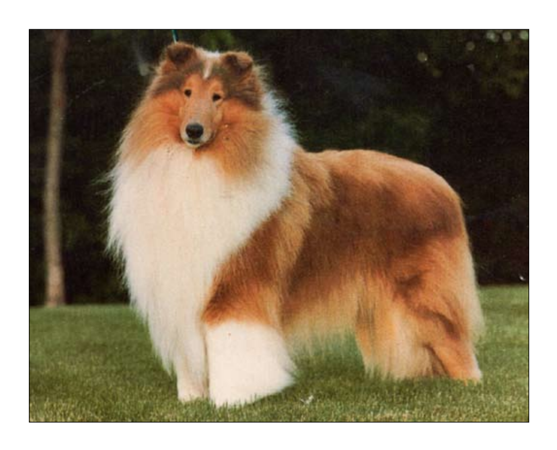
CH. CANDRAY CONSTELLATION Best of Breed • CCA 1988