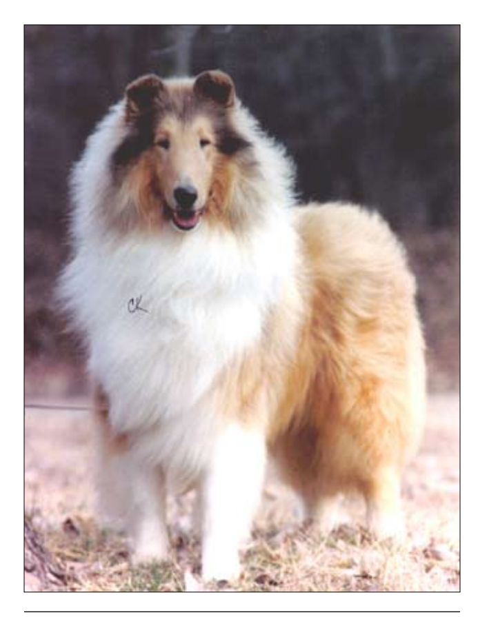
Ch. Afterhours Firestorm