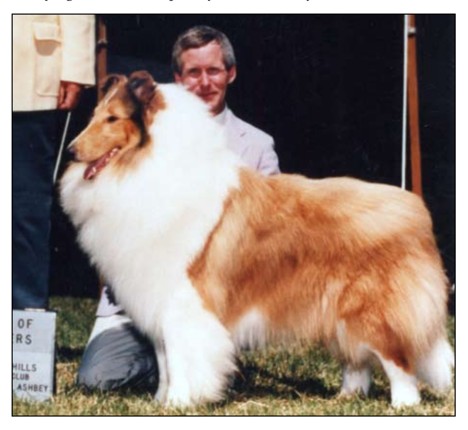
Ch. Perry's Sundather Tradition, ROM

Respondents who have judged the national specialty are indicated by asterisk.