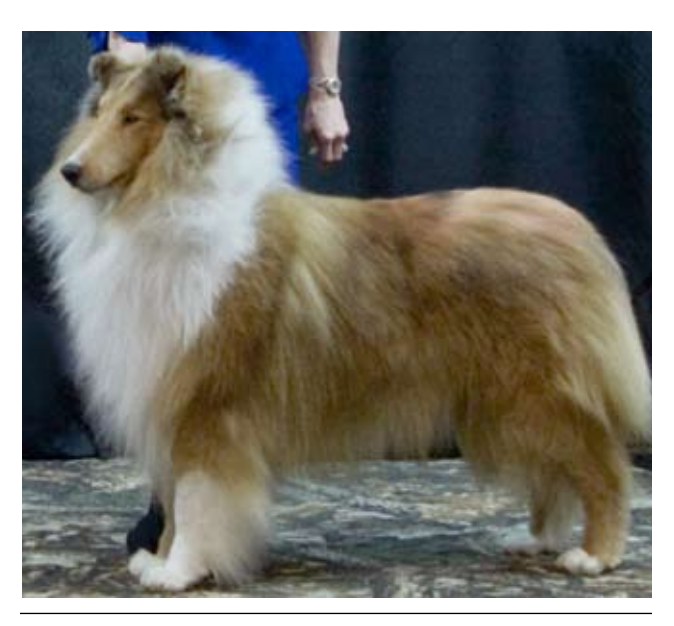
Ch. Southland's Beyond The Glory