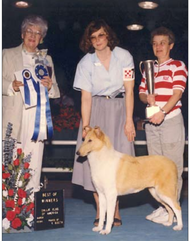
Ch. Capella's Masquerade