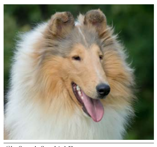
Ch. Sassy's Smokin' Dragon