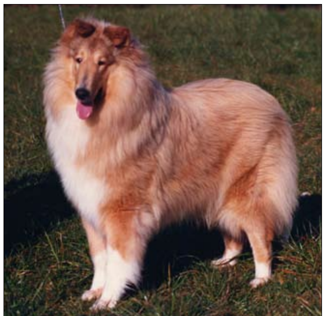
Ch. Wickmere Noblesse Oblige

I have thought about it for a long time too and as you know, I have had a sable merle or two. I do think that there are enough classes for them to be shown in puppy, bred by and Am bred. Yes, Open too if they don't carry the merleing too heavily but that's up to the exhibitors discretion and they can't complain if they put one in the open class that sticks out like a sore thumb. A quality animal should be judged on virtues against our standard. Eye color seems to be one of the hurdles when it comes to sable merles. My personal feelings are the same as they are in blue merles. A bright blue eye or a glass eye is awful no matter if it's blue or sable merle.