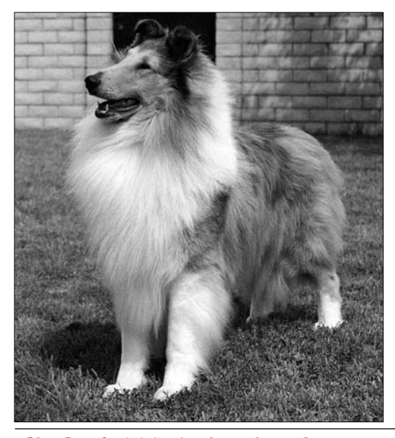
Ch. Gambit's Trick of Light, ROM