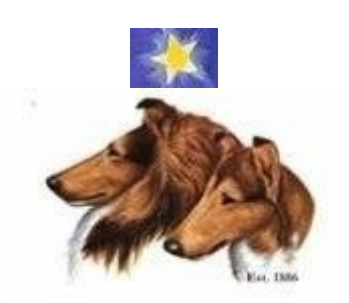
COLLIE CLUB OF AMERICA SHINING STAR 2012 ANNUAL REPORT