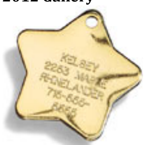
Gold Star Collar Tag